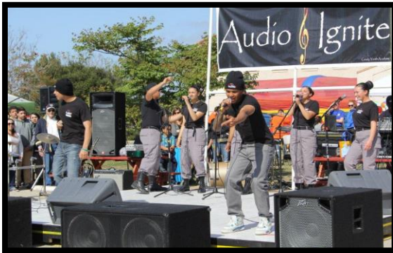
Live Music Performance

Professional Recording Fat Cat Studios Sacramento, CA