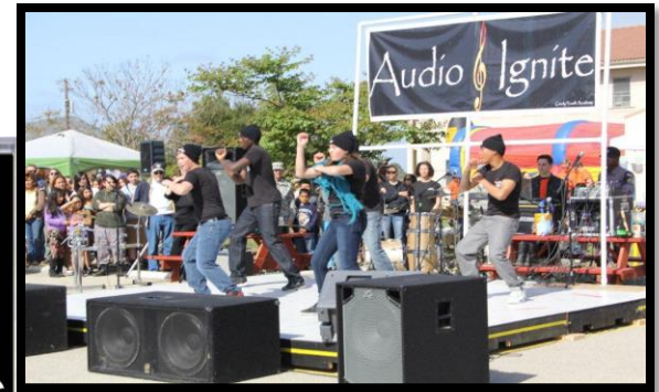
Live Dance Performance